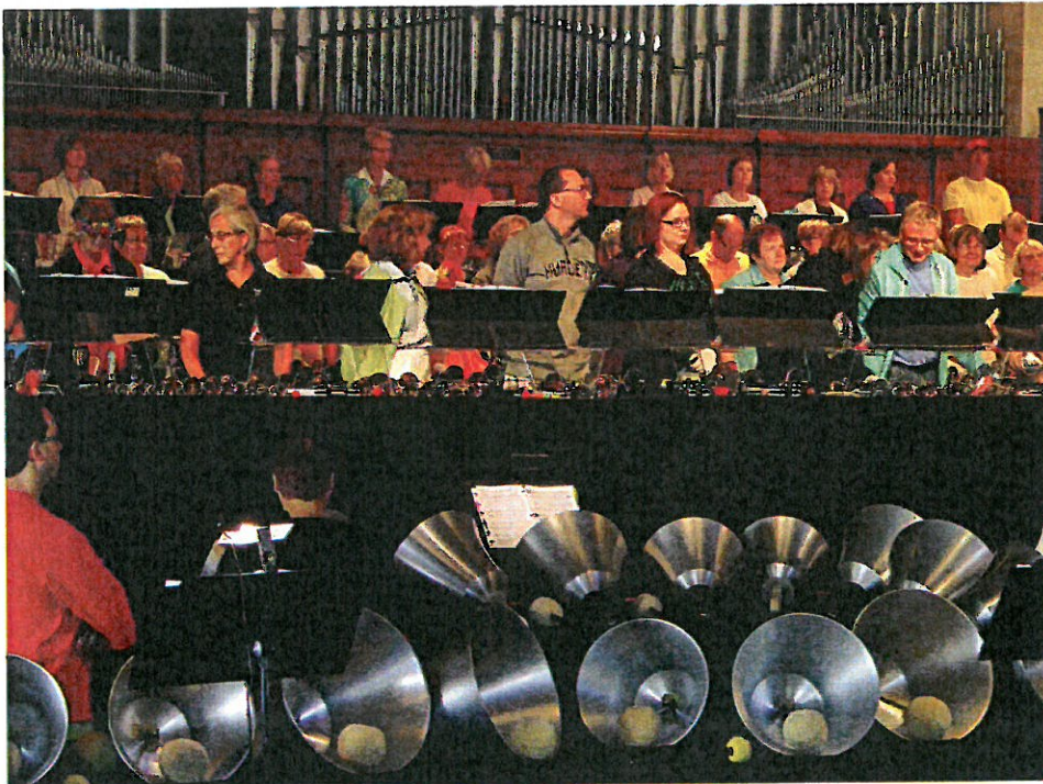
Practice makes perfect! The week of Handbells is a long tradition and much anticipated event for Bay View and the Handbell Choir.